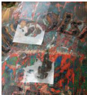
d. Pictorial layer consolidation with japanese paper