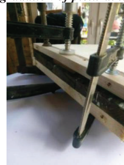
f. Obtaining the panel flatness