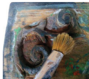
h. Final cleaning by easy brushing