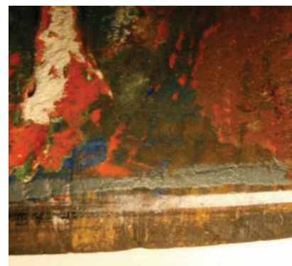
i. Pictorial layer with putty