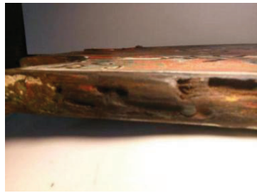
b. Holes of insect attack