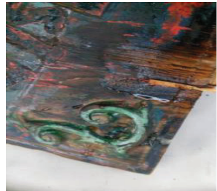
c. Carved corner ornament and the degradation of pictorial layer