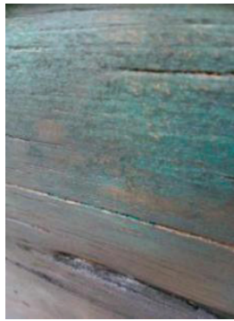
a. Longitudinal cracks