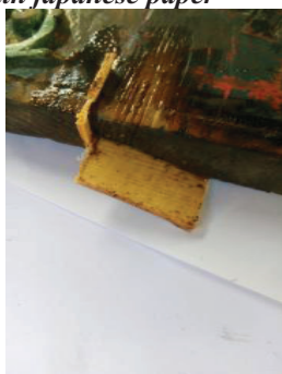
g. Addition of material