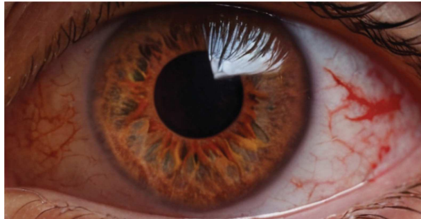
Fig. 1. Sample image used for training.

In the context of this study, a Support Vector Machine (SVM) algorithm has been utilized to detect and locate specific targets in the images captured by drones. The algorithm maps the input vectors into a high-dimensional feature space where a hyperplane is constructed to separate the different classes based on a defined criterion. The SVM model is trained using a set of labeled training data and then used to detect these targets in new, unseen images. Datasets utilized in this study are sourced from various public domain repositories [18–20] and include synthetic data as well. An example image employed for training the Machine Learning model is presented in Fig. 1.