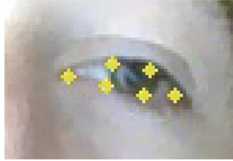
Fig. 3. Detecting the eye boundaries in 6 points.

function, resizes the eye image to the specified size using the cv2.resize function, flattens the eye image into a feature vector, verifies if the processed image size is correct (4096 features), utilizes the SVM model to predict the eye status, and adds the classification result to the list of classifications. The function then returns this list of classifications.