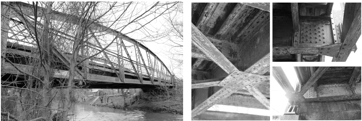
Fig. 1. Existing structure – view and joints details

The bridge is a rivetted type, build around year 1925 in Transylvania and from the geometry point of view, having a parabolic truss main beam structure, with descending diagonals with a span of L = 27.86\text{m} and a width of 6.25\text{m} (road for only 5.30\text{m} ). The structure is similar to other bridges built in the same period: heavy deck (with pavers) consisting of Zores profiles arranged on a network of beams consisting of stringers and cross girders with a bracing system ensuring the spatial stability of the structure. The elements are made of composed cross section – L type profiles with additional steel plates (figure 1).