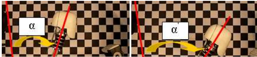
Figure 2. Inclination of mobile arm in the two cases

In this case the inclination angle of the mobile arm of the test bench is greater, as related to the normal sitting position (with the back leaning against the seat back), figure 2.