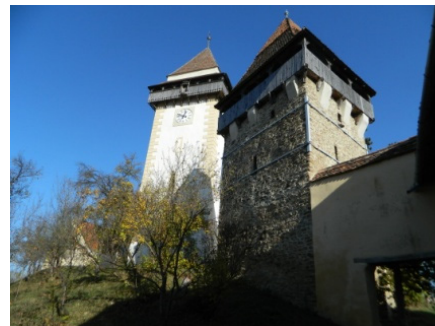
Figure 7. Apold village - The Evangelic Fortified Church.