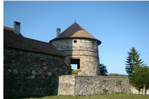
Figure 5. Racos village - Sukosd-Bethlen Castle (photo from author’s collection).