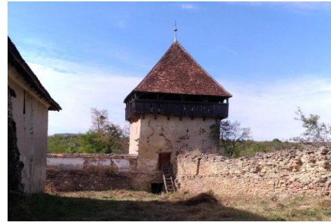
Figure 3. Cobor village – Fortified Reformed church.