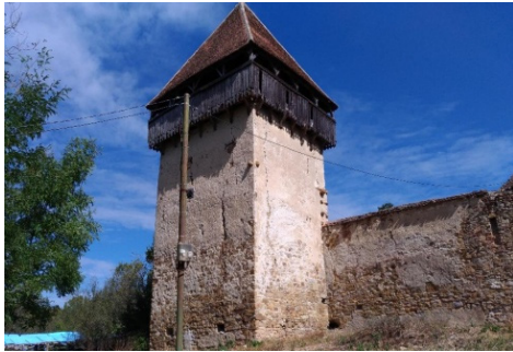
Figure 2. Cobor village – Fortified Reformed church tower.