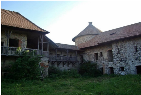
Figure 4. Racos village - Sukosd-Bethlen Castle.