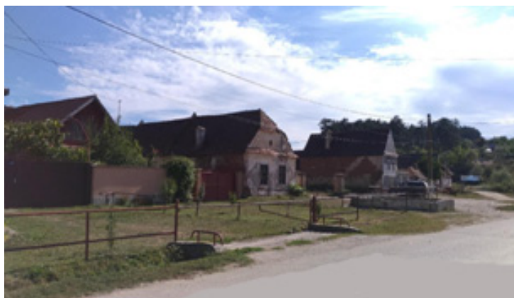
Figure 1. Ticuș village – the main street.