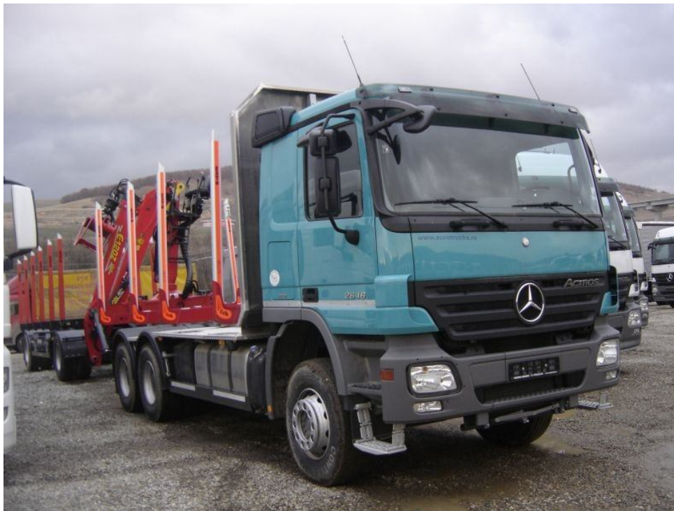
Fig. 1. Mercedes ACTROS 2646 [14]

Adding the effects of all decks, a multiplication factor is obtained for the entire truck (Table 4):