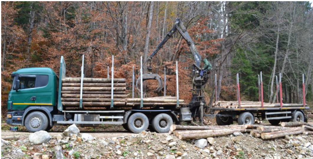
Fig. 2. Truck with trailer for logs transport [14]